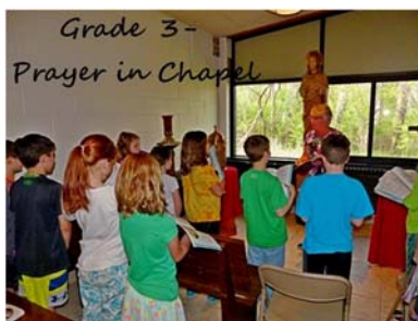
Grade 3 - Prayer in Chapel