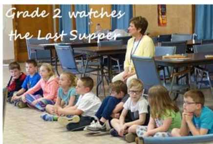
Grade 2 watches the Last Supper