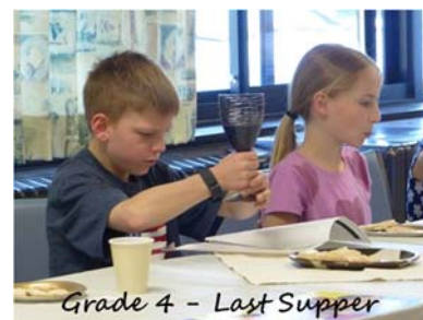
Grade 4 - Last Supper

As the concluding activities of the school year occupied our classes, many classes had some unique experiences.