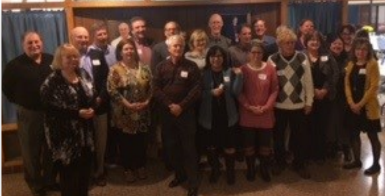
St. Joseph's School alumni from 1968. Their 50 th class reunion was held at St. Joseph's Parish Center on October 20 th .