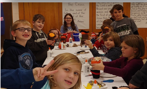
The second grade class had a little help from some fifth graders while making their saint pumpkins.