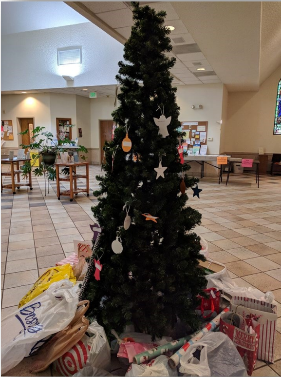
Our giving tree! Thank you to all who donated to those in need.