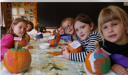
The first graders were very proud of the pumpkins that they decorated.