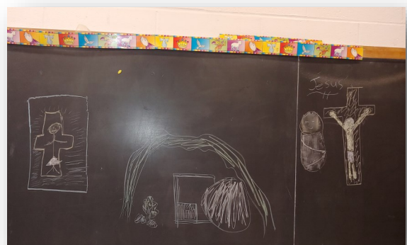
The fifth grade class used art work to tell the story of the saints lives.