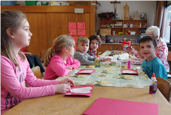
The first grade class was caught decorating their valentine cards. They seemed very pleased with the outcome!

Mrs. Brooks has lots of interesting spring projects coming up for them. Growing flowers is just one of the ways they will be learning about God's creations.