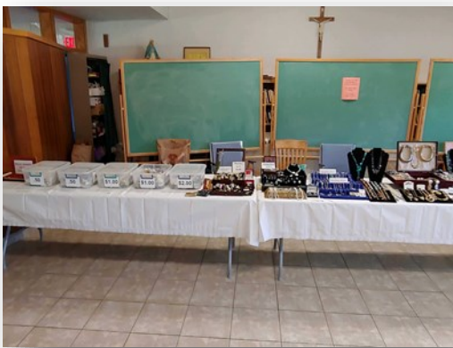
Tag & Treasure Sale 2019 ~ the famous jewelry tables were all set up & ready for the rush on Friday morning!!

was the happy winner of the Irish Chain Quilt that was raffled off after mass on Mother's Day. Many thanks to our quilters who sewed such a beautiful creation!