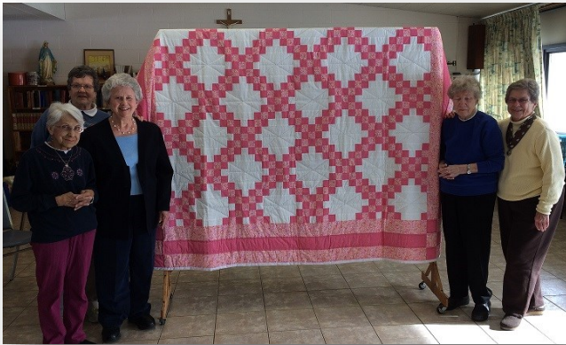
The Quilting Ladies - pose with their beautiful Irish Chain Quilt that was auctioned off on Mother's Day!