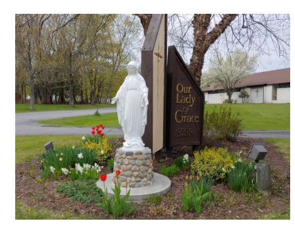
73 Midline Rd, Ballston Lake, NY 12019 Office Hours: Mon-Wed 9-3

518-399-5713 mayerd@nycap.rr.com www.olgchurchbl.org