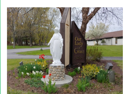
73 Midline Rd, Ballston Lake, NY 12019 Office Hours: Mon-Wed 9-3

518-399-5713 mayerd@nycap.rr.com www.olgchurchbl.org