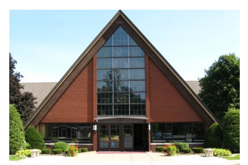
400 Saratoga Rd, Glenville, NY 12302 Office Hours: Mon-Fri 9-12 & 1-4

518-399-9168 icchurch400@gmail.com www.icglenville.com